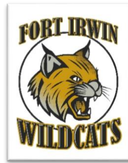
Fort Irwin Middle School "Home of the Wildcats!"