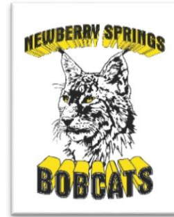
Newberry Springs Elementary School "Home of the Bobcats!"