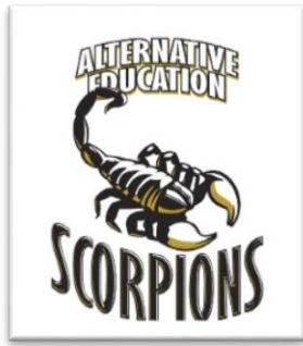
Alternative Education Center "Home of the Scorpions!"