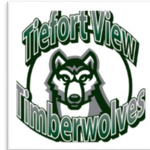
Tiefort View Intermediate School "Home of the Timberwolves!"